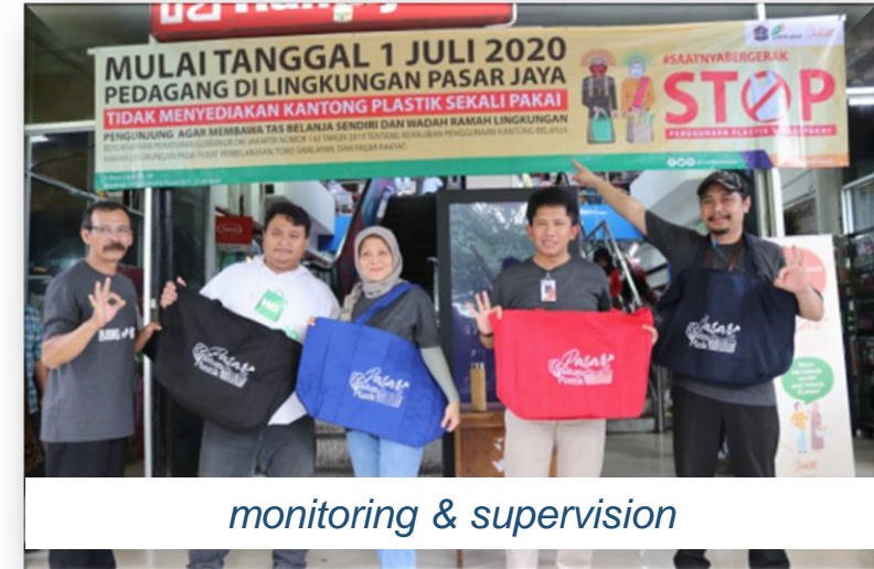
monitoring & supervision