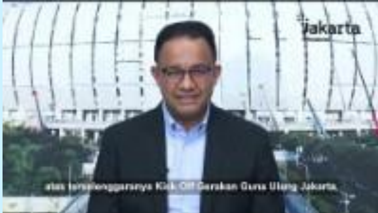
Support from Mr. Anies Baswedan, Governor of DKI Jakarta for The Jakarta Reuse Movement