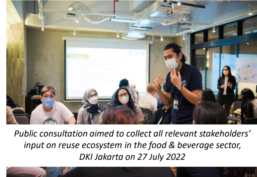
Public consultation aimed to collect all relevant stakeholders' input on reuse ecosystem in the food & beverage sector, DKI Jakarta on 27 July 2022