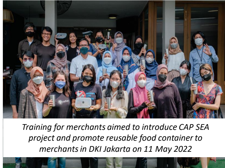
Training for merchants aimed to introduce CAP SEA project and promote reusable food container to merchants in DKI Jakarta on 11 May 2022