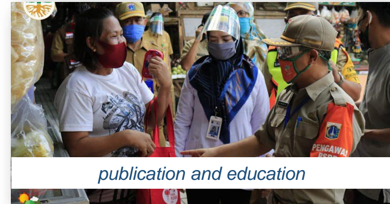
publication and education