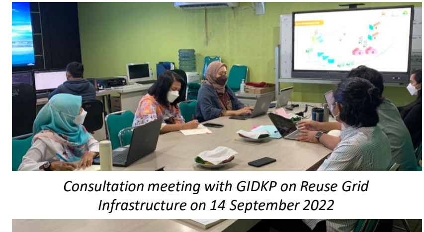
Consultation meeting with GIDKP on Reuse Grid Infrastructure on 14 September 2022